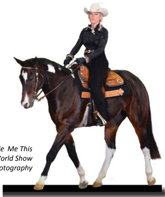
Adelaide Pickett/Riddle Me This 2014 WDAA World Show